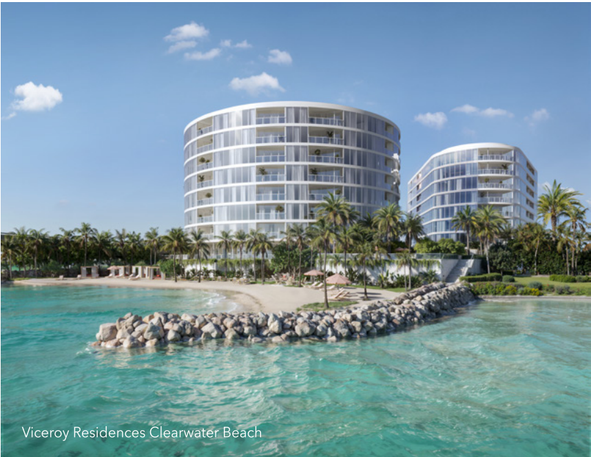
Viceroy Residences Clearwater Beach