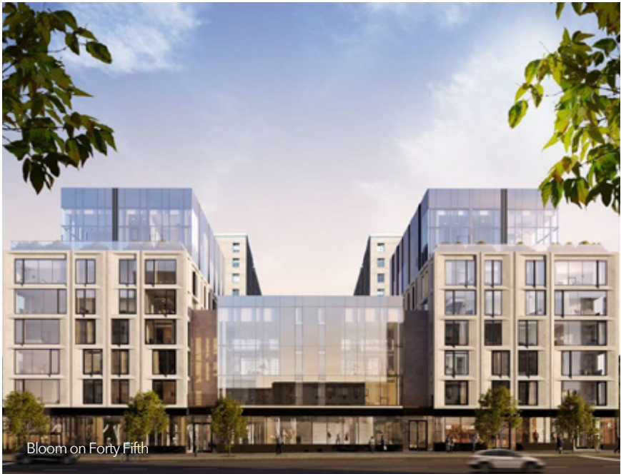
Bloom on Forty Fifth