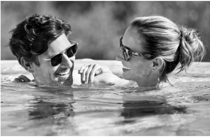
PRIVÉ MALIBU | PRIVATE RESIDENCES