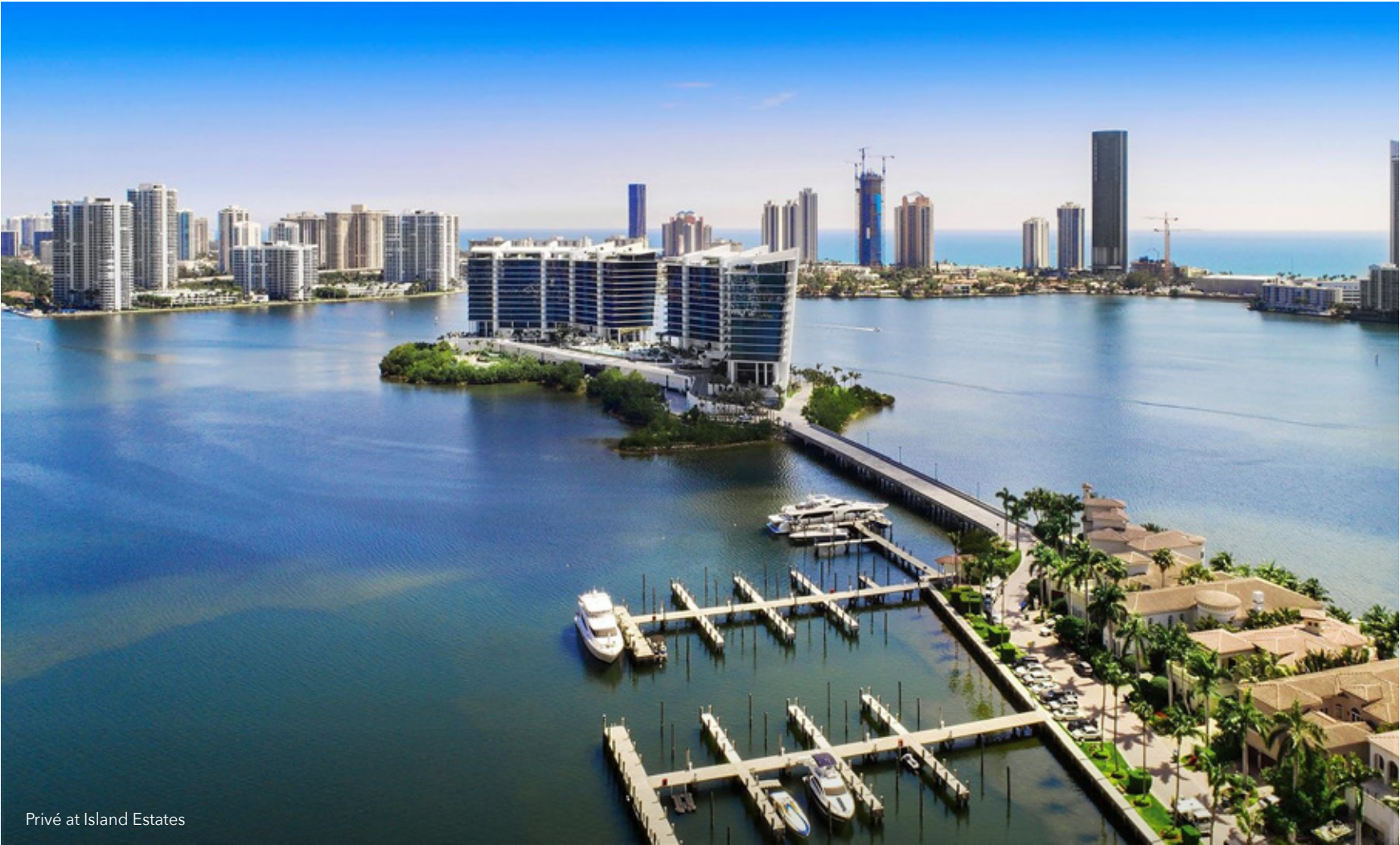
Privé at Island Estates