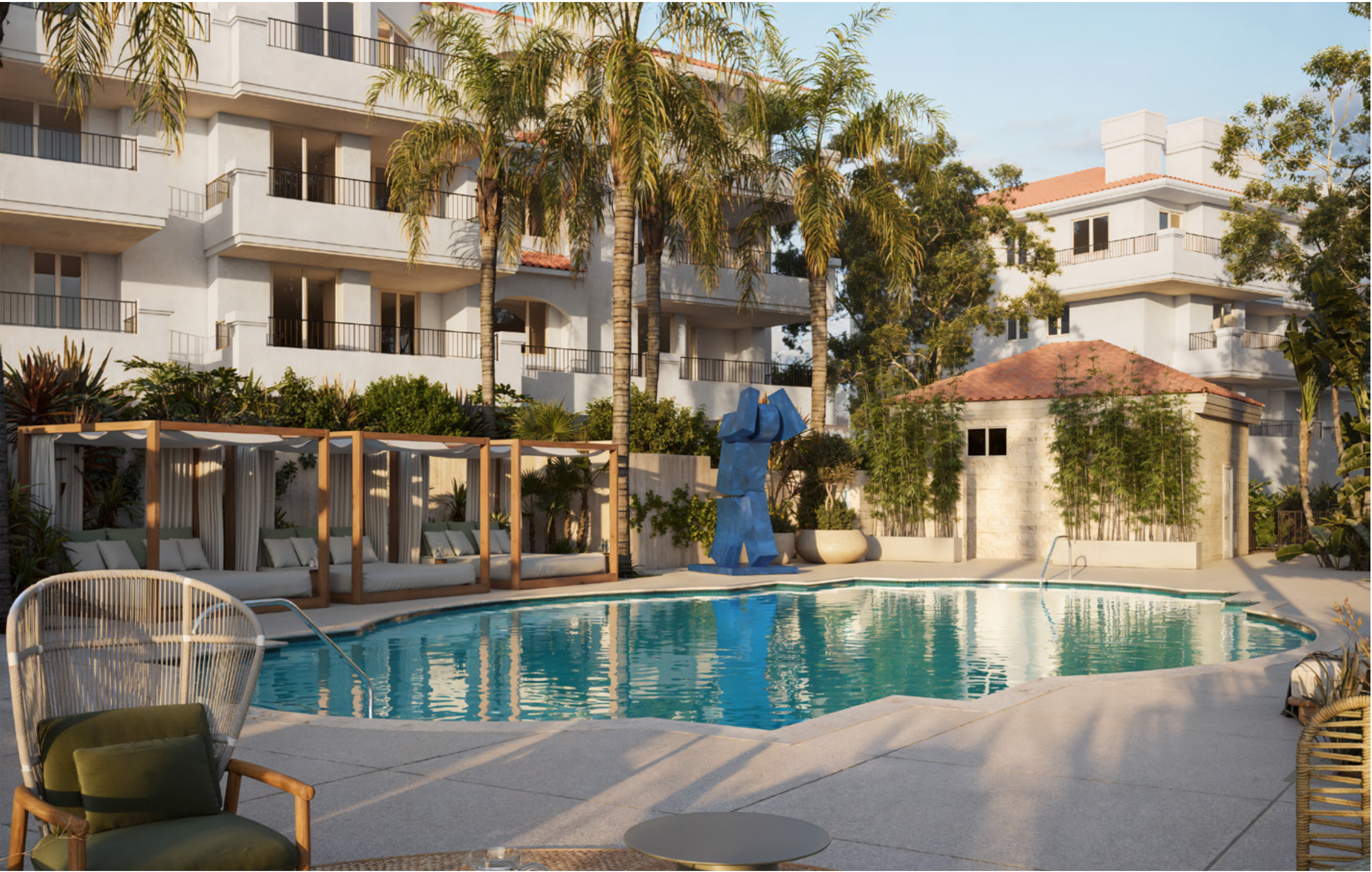
PRIVÉ MALIBU | PRIVATE RESIDENCES